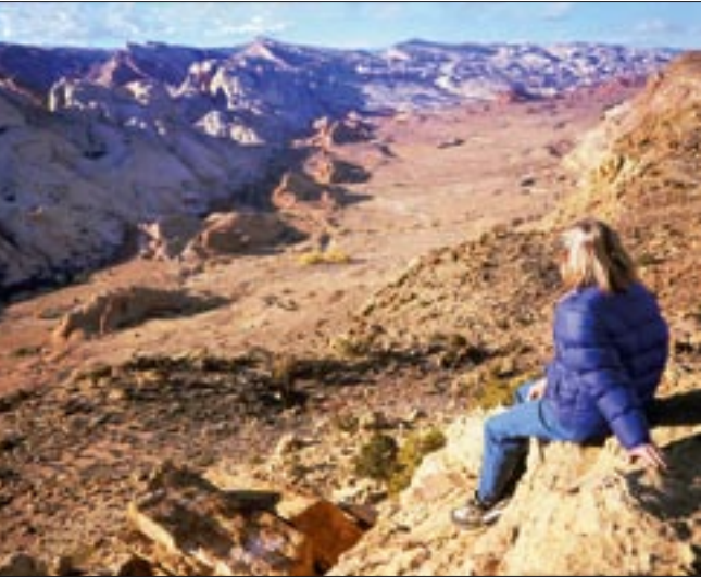
Halls Creek from the Overlook

Once in the valley, you'll find the entrance to Brimhall Canyon about 0.2 mile south across the stream. Don't be fooled by the easy hike inside the initial part of the canyon. Although Brimhall Bridge is less than a mile from this point, it is quite an adventure which should not be undertaken alone. Soon after climbing the slippery slope of a dry-fall, you reach a 100 feet long narrow passage, usually filled with dark water, which you must wade deep or even swim. Exiting at the end of this pool requires a hard scramble on