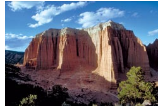
The uppermost giant monolith at Cathedral Valley

Soon after that, you'll reach the junction with Thousand Lakes Road, coming down from the mountain in front of you. Bear right and \frac{1}{2} mile later you'll come to the primitive Cathedral campground,