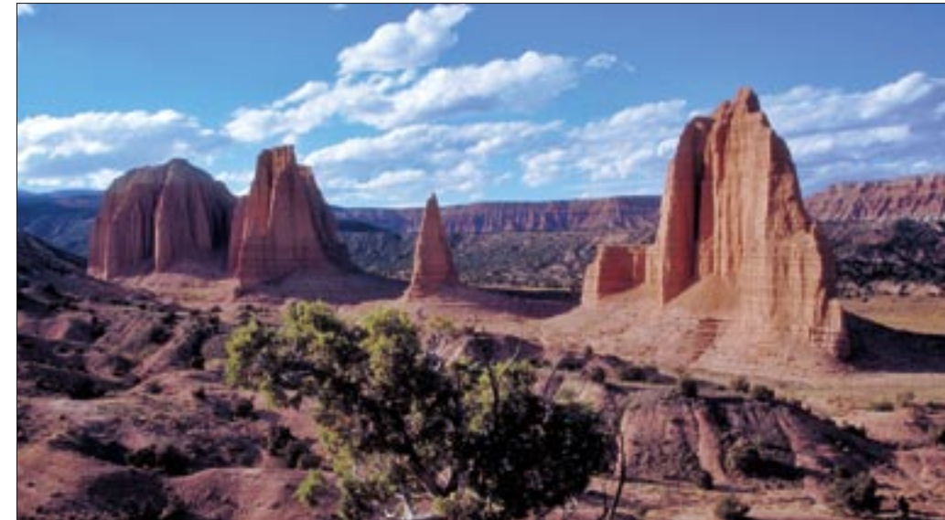
Upper Cathedral Valley monoliths

If there is no risk of rain later in the day, you could also start before dawn from