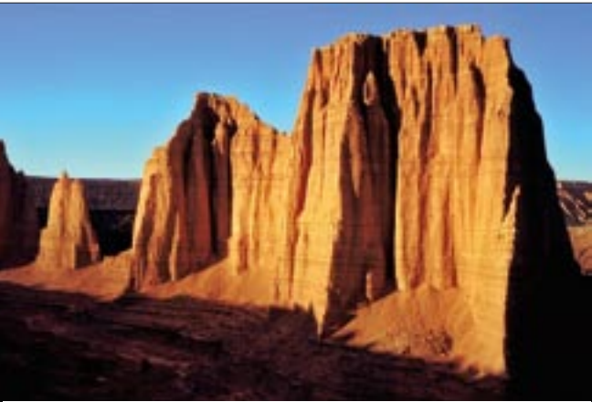
Upper Cathedral Valley

From here, descend the switchbacks to enter the valley. Less than 2 miles past the campground, you'll come to a sign saying "Viewpoint" on the north side of the road. There, you'll find a narrow footpath leading up to a low plateau with a spectacular close-up view of the two main groups of 500 feet high monoliths and the Walls of Jericho in the background. This easy hike is 2-mile long, round-trip, and offers different angles for photographing the monoliths, which are best lit in the second part of the afternoon.