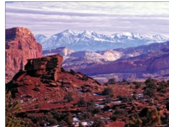
The Henry Mountains from Panorama Point

Continuing almost another mile on the dirt road south of Panorama Point, you can take