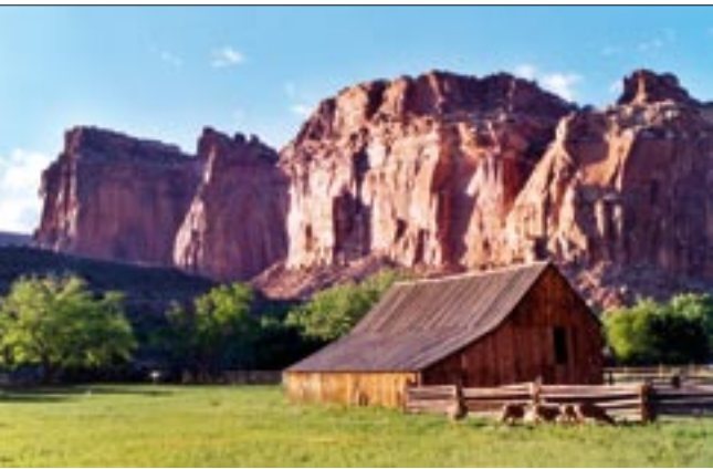
Fruita Oasis

In all seasons, Fruita is an oasis where it's nice to relax between two rocky landscapes. This old Mormon colony is located on the banks of the Fremont River and has abundant vegetation, contrasting heavily with the surrounding desert. Near the Visitor Center, a cabin containing pioneer-era artifacts is visible from the road and warrants a brief stop.