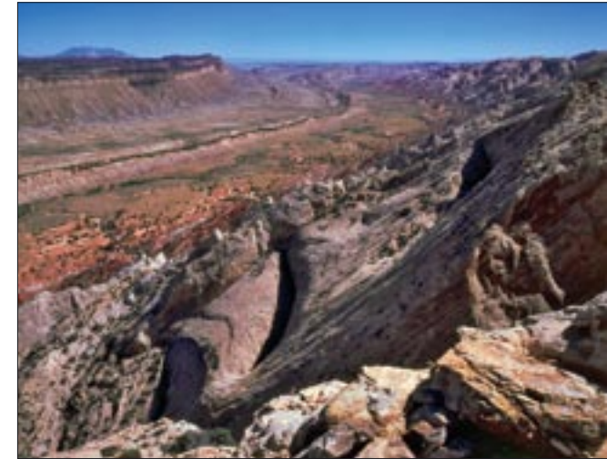
The Waterpocket Fold from Strike Valley Overlook

If you prefer to explore Upper Muley Twist, just follow the wash at the trailhead until you reach Saddle Arch on your left, at a little under two miles. This arch is not easy to spot at first, but it is almost opposite the small sign to the right of the wash indicating the Rim Trail. It is a very rough climb up the Rim Trail; you'll reach the top in less than 30 minutes and the rim of the plateau in another 10 minutes on flat ground. From there, the trail follows the rim north for another two miles, offering spectacular views of the Waterpocket Fold.