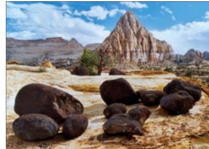
Pectol's Pyramid

At 2½ miles from the car park, the Rim Overlook provides a nice bird's eye view of Fruita and the Fremont