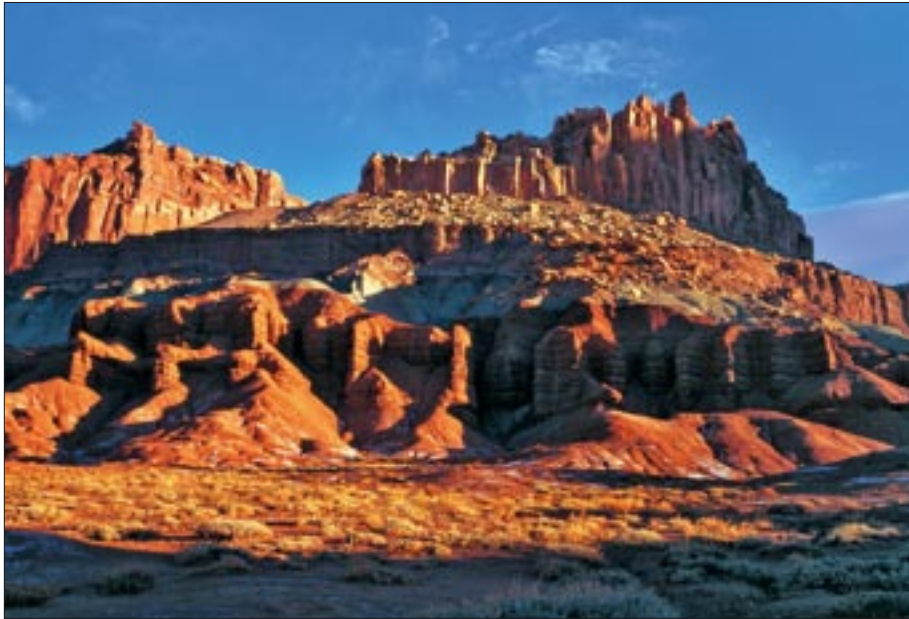
The Castle at dawn