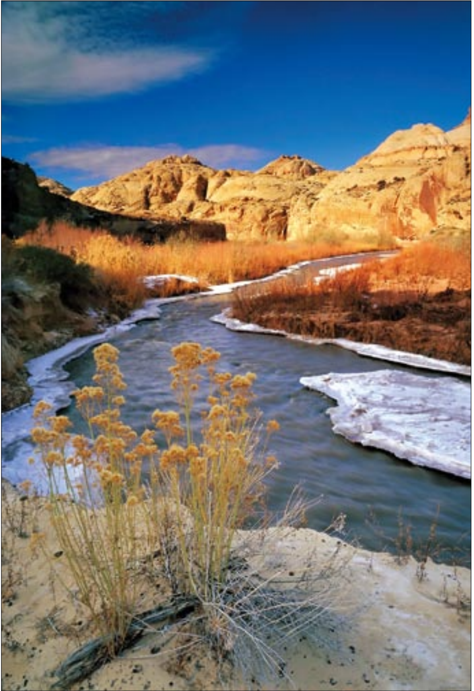
Wintertime along the Fremont River