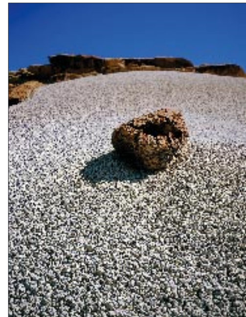
Waterpocket Fold badlands

Instead you may want to concentrate on details in the landscape. This area contains amazingly colorful stripes of tuffa, lining up the badlands on the east side of the road. They are best photographed in early morning, when still in the shade, or in late afternoon. However, to really bring out the color, nothing beats an overcast or rainy day; just remember to eliminate the sky from your image.