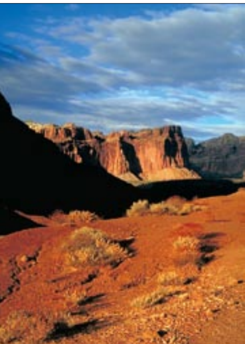
Early morning on the Scenic Drive

Wash, locate the last little hill before the road starts its descent toward Fruita, park on the right and enjoy one of the most photogenic views in the park. You'll be looking at badlands topped by pillars and cliffs to the right, with the narrow road winding down spectacularly toward the oasis and the Castle in the background. You can use a wide range of lenses to capture either grand scenics or small details of this beautiful landscape.