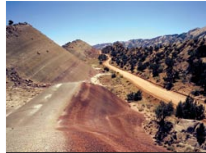
Badlands along the Notom-Bullfrog Road

Located in the southern part of the park, this strange and spectacular geologic formation is unfortunately less spectacular when seen from the ground than in the superb aerial photograph that decorates the NPS brochure. But it still warrants a detour if you can afford the pretty full day that it will take to drive the 125-mile loop described below. Note that this tour—one third of it on dirt roads—encompasses the superb Burr Trail, described in the Along Scenic Byway 12 chapter.