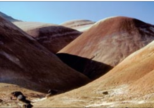
The Bentonite Hills

The road overhanging the South Desert and the Bentonite Hills, called the Hartnet Road, begins at River Ford and follows a dry riverbed between the extreme northern end of the Waterpocket Fold and the depression of Cathedral Valley.