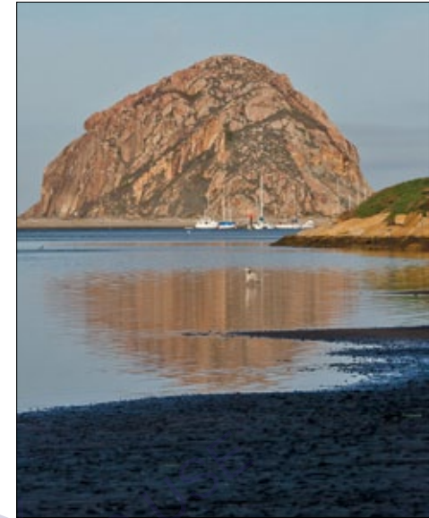
The view near Morro Bay S. P. campground

Nearby location: Also near the campground is a harbor for small boats, which is one of the calmest parts of the bay and can provide mirror-like reflections.