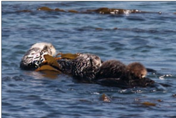
Sea otter and pup in the kelp beds

Getting there: Just north of Morro Bay on CA-1, take Atascadero Road west towards the ocean. It changes in name to Embarcadero Rd., as it curves left. Continue past the end of the road and curve right into a dirt parking lot, close to Morro Rock.