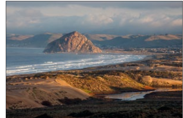
Winter morning light on Morro Rock

South of the cove the shoreline is rocky, accessed via the Bluff Trail. The first section of the Bluff Trail provides an excellent view of Morro Rock, which is lit by the rising sun on winter mornings. Further along the trail, you'll find wave-washed points and rocks, and at the right tide level there's even a small blowhole which sends mist into the air. Place the rising sun at your back to see a rainbow in the mist of the blowhole.