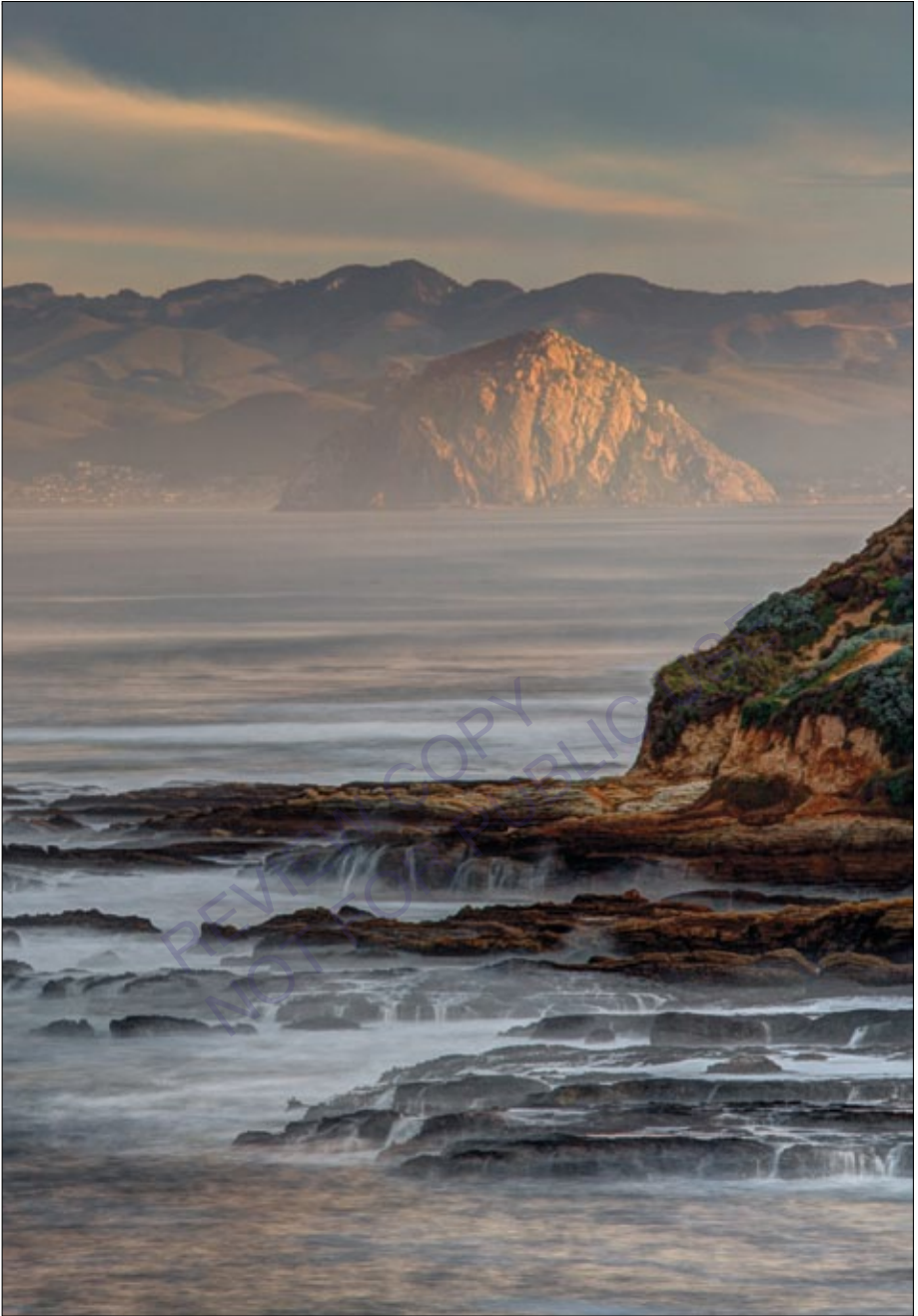
First light on Morro Rock from Montaña de Oro