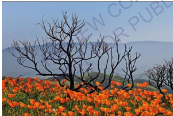
California poppies in early April

Home to an annual wildflower bloom each spring, Figueroa Mountain provides a variety of species at various elevations, diversifying your opportunities and extending the wildflower season. The U.S. Forest Service often provides updates on the timing and progress of the wildflowers as they emerge in the February through April timeframe. If you have the opportunity, check their web site for current conditions.