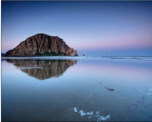
April moonset before dawn

The volcanic plug, Morro Rock, towers 581 feet above the adjacent ocean and beach. There are over two miles of sandy beach north of Morro Rock. The beach close to the rock offers a very gradual slope towards the water. From the southern end of the beach, low tide can provide you with wet sand to capture Morro Rock and its reflection. A minus low tide is even better.