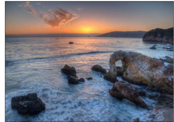
Natural bridge just north of Pirate's Cove

Nearby location: A second, less prominent trail leads out onto the small peninsula and rock which the cave passes through. Side trails lead to points on the cliff where people have explored for possible shoreline access. One trail offered a thoroughly rotten climbing rope tied to an unstable metal stake weakly pounded into the ground. Even the area around the top of the rope was dangerous, sloping towards a 30 to 40-foot drop off the cliff to the rocks and surf below. From the trail approaching that spot however, you may find a spot to stand sufficiently anchored in surrounding bushes to safely capture a sunset shot of a natural bridge below.