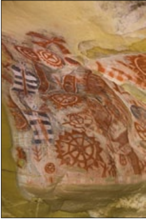
Pictographs at Chumash Painted Cave S.H.P.

Chumash Painted Cave contains some of the best surviving examples of rock art created by the Chumash tribe of Native Americans. Sadly, the cave must remain closed to entry to prevent vandalism.