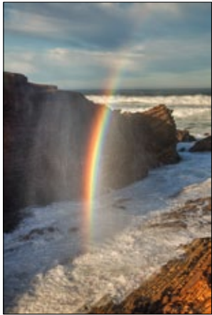
Blow hole rainbow on the Bluff Trail

Photo advice: This convoluted and wave-washed rocky shoreline is particularly well suited to long exposures of waves washing over rocks. You can use a 10 stop neutral density filter to enable a very long exposure, or stop your lens down and set your ISO low, and add filters such as a circular polarizing filter and graduated neutral density filter. It will also help if you're shooting during sunrise, sunset, or twilight.