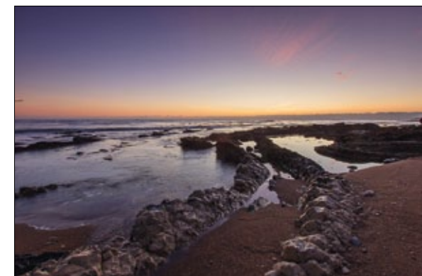
Reef pattern at Eldwayen Ocean Park